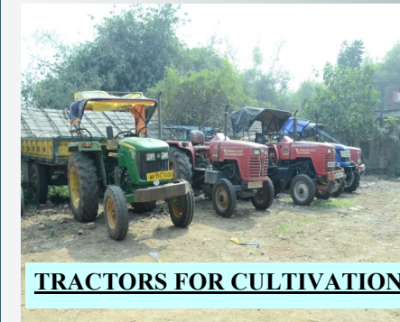
TRACTORS FOR CULTIVATION