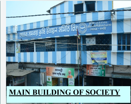
MAIN BUILDING OF SOCIETY

Starting its journey from 1961 Polba SKUS LTd , situated at Polba – Dadpur Block of Hooghly District and financed by HOOGHLY DCCB LTD, has touched a milestone in respect of diversification of society's business. The society has total membership of 2306 individuals mainly cultivators within its periphery, of which 702 members are KCC card holders. It has a deposit of Rs 3.53 Cr and KCC loan amounts to Rs 3.70 Cr. With 300 no. of SHGs, its working capital is Rs 11.88 Cr on 31.03.2022 and it has about Rs 66 lakh accumulated profit till 21-22 financial year. Among diversified business it possesses Custom Hiring Centre, Mini Deep Tube well , Customer Service point, Cooking Gas Supply and Purified water Supply. All these ventures have helped the society to stand on its foot with pride. Other conventional business of the society like KCC, SHG, Deposit , Fertilizer etc are also remarkable . New generation employees are in society's workforce to uplift the prestige of it.