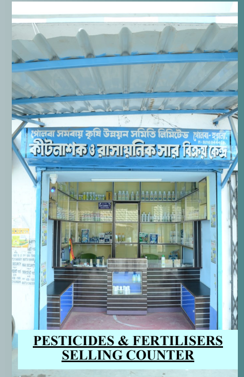
PESTICIDES & FERTILISERS SELLING COUNTER