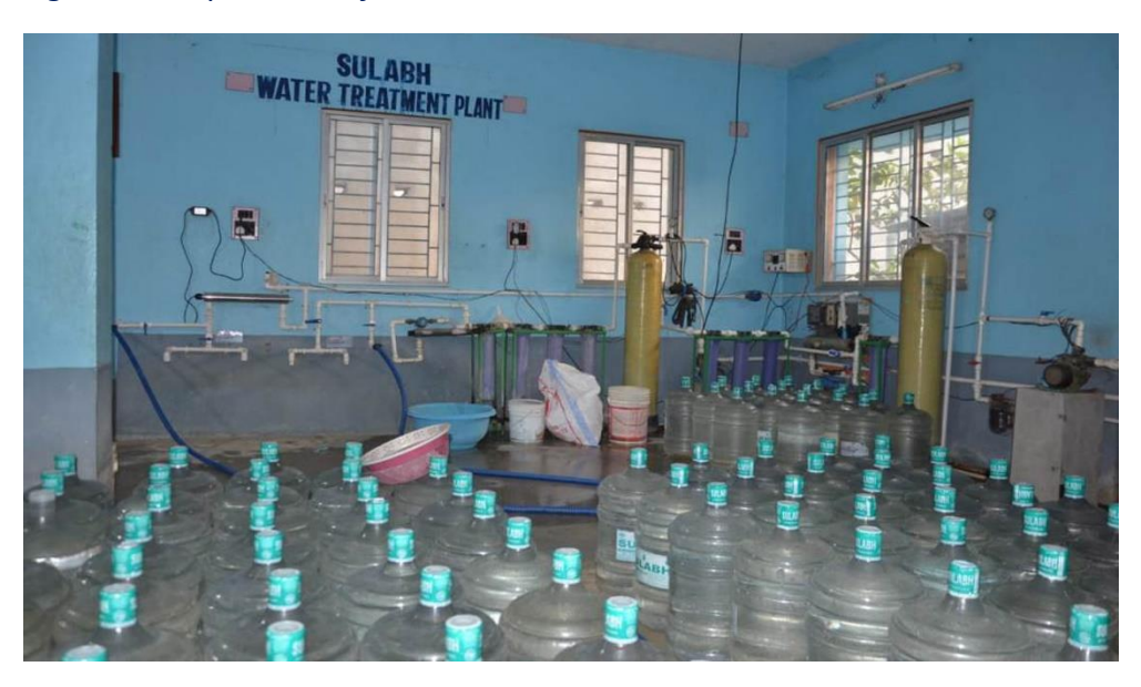
Figure 2: Rural Water treatment Plant in Madhusudankati SKUS Ltd