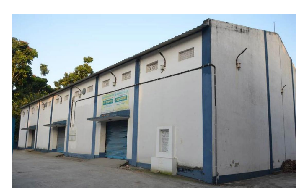
Figure 4: 1000 MT Godown built under RIDF

The Society also contributes to social cause and undertakes different programmes beneficial for the members and the people of the locality as a whole , organizing Health Check-up camps, running medical facility centre, children's park , community centre etc.