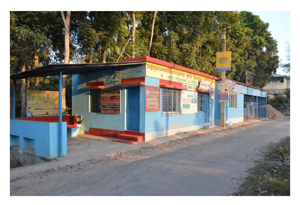
Figure 6: Free medical service centre maintained by Madhusudankati SKUS Ltd

Madhusudankati S.K.U.S. Ltd has ever been a pride of the Co-operative sector in the district of North 24 Parganas.