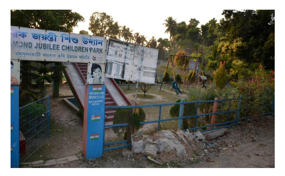
Figure 5: Children's Park being maintained by the Society